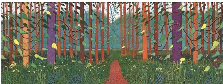
Hockney: Arrival of Spring;

TASK 2: Draw an important view/place to you, using only bright colours. (NO Hi-lighters!)