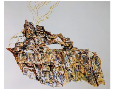
Staff example -Anglezarke Quarry

The drawing should take no more than 1 hour , but should be as ambitious as you can be. Materials are up to you. This is something that has been done by artists across time. See the artist examples shown as well as my own to get you started, please research other artists who might inspire you more. Of course you can do as many drawings as you like, but one is required, a more committed approach is appreciated though.